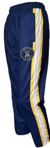
SIJCC Girls Playing Pants