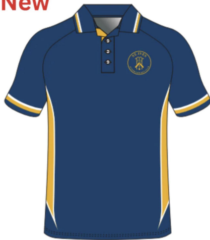
SIJCC Training Shirt